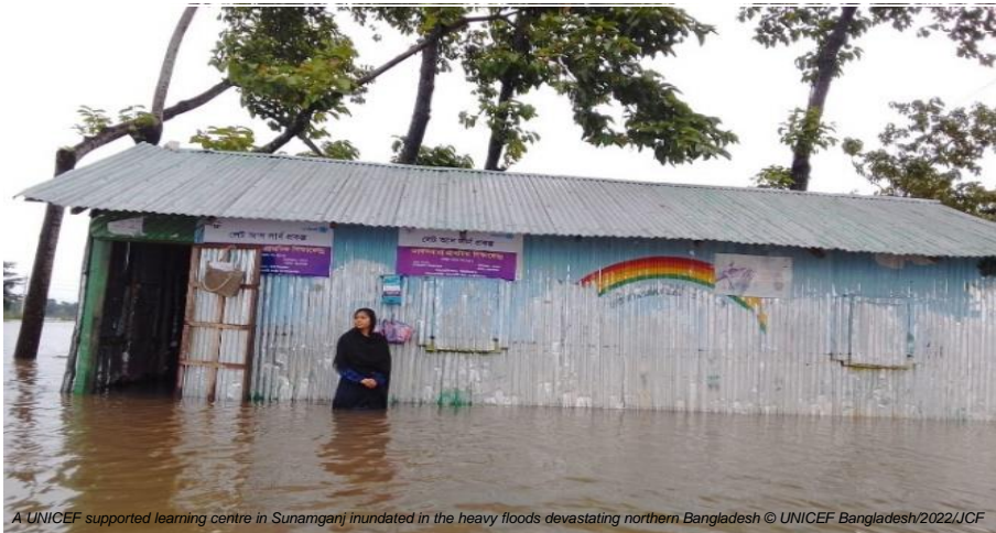
A UNICEF supported learning centre in Sunamganj inundated in the heavy floods devastating northern Bangladesh